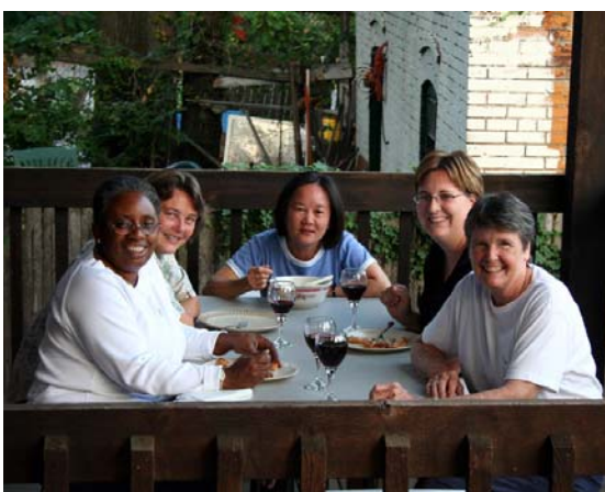
Enjoying Saturday night dinner on the back deck