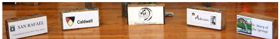
Bricks with logos representing the Novices' Congregations and the CDN - San Rafael, Caldwell, CDN, Adrian, Columbus