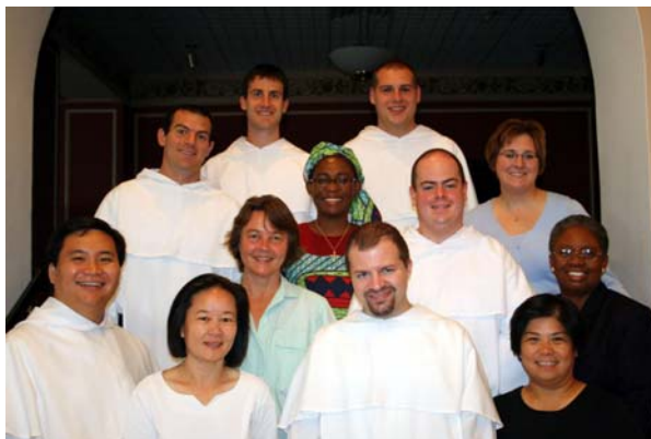
CDN Novices with Dominican First-Year Student Brothers

Our primary focus this year is on prayer/contemplation and community. We gather daily at the Novitiate for morning, evening, and/or night prayers, and on Tuesdays we join our Dominican brothers for Morning Prayer and Mass at the Dominican Priory, a mile or so up the road. One of the Dominican friars comes here on Thursday mornings to preside at Mass in our chapel. We take turns leading our daily prayers, drawing from Dominican Praise and/or sharing the diversity of