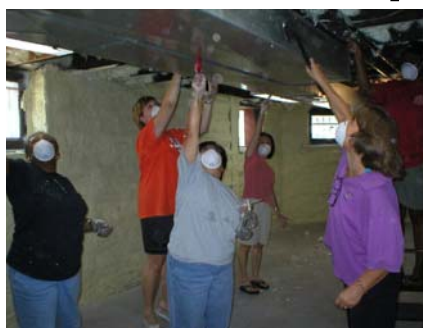
Transforming the basement into community space (just the beginning . . .)