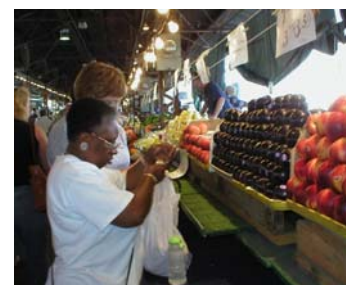
Shopping at the Soulard Farmers' Market