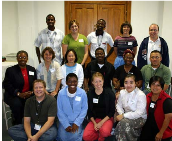
Novices of the 2006 - 2007 St. Louis Inter-Community Novitiate

During our weekly gatherings we are blessed with ample time to truly get to know each other on an individual level. As we explore one another's stories we are continually reminded that although we are diverse in so many ways, we come together as women and men who have all experienced a call from our Creator and are committed to exploring that call.