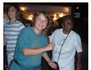
Dancing at the Cathedral Festival