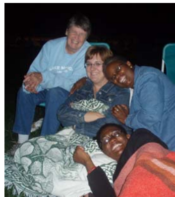
Keeping warm at an outdoor concert