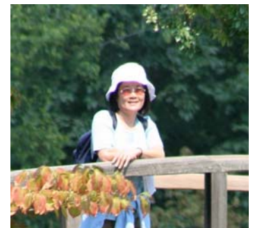
Reflecting at the Botanical Garden