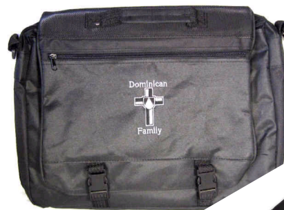
Expandible attache case with embroidered logo $24.95

Available from Dominicus Books are bags, shirts and pens/pencils bearing the Dominican Family logo: