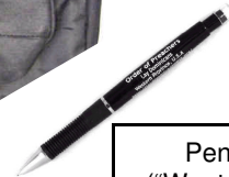
Pen or Pencil ("Western Province") $1.50/1.00