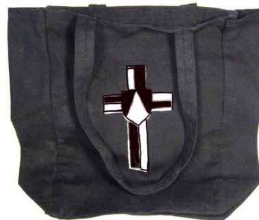
Screen printed tote bag $6.00 Also a messenger bag at $15.00

Cotton Polo Sizes: S, M, L, XL, 2XL, 3XL - Fabric Style: Two-Ply Pima Jersey in black, white, or red, $15.00