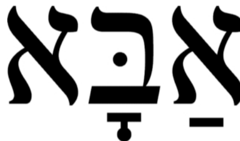
Abba in Aramaic